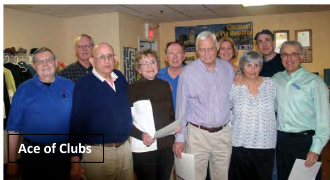
Ace of Clubs