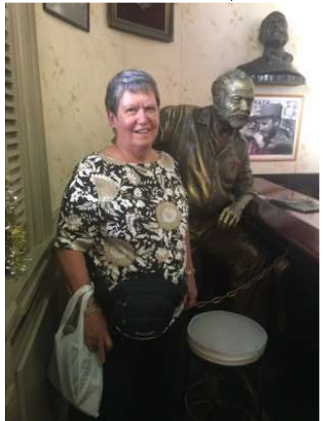
Elaine Following Hemmingway